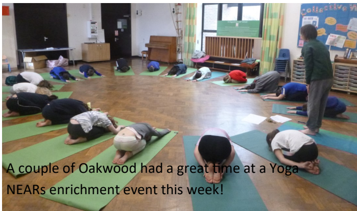
A couple of Oakwood had a great time at a Yoga NEARs enrichment event this week!

A big well done to all those who participated in the NEARs Handball and Yoga events too—you did Twineham proud!