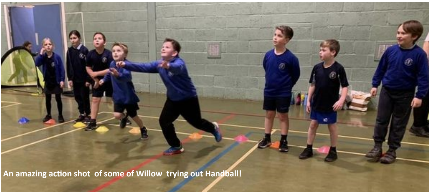
An amazing action shot of some of Willow trying out Handball!

https://www.youtube.com/embed/70j3xyu7OGw